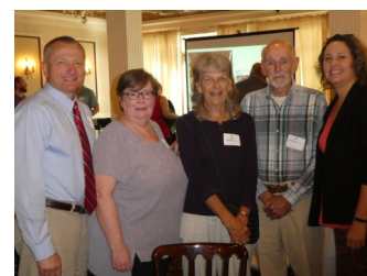
Honoring our supporters.